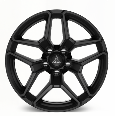
20 by 10-inch Black Noise // (WRS) Included with Plus Group and Blacktop Package