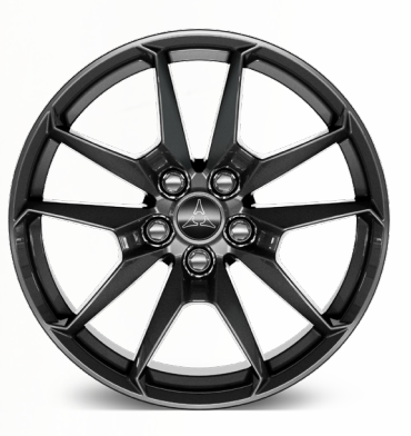
20 by 11-inch/11.5-inch Luster // (WC5) Included with Track Pack and Carbon & Suede Package