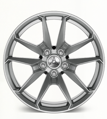
20 by 11-inch/11.5-inch Satin Carbon // (WC1) Included with Track Pack