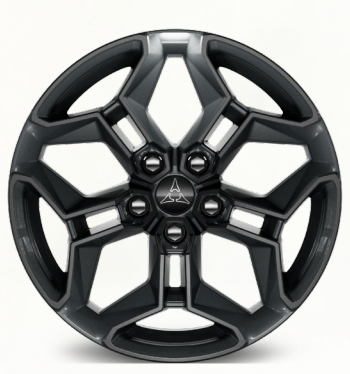
20 by 9-inch Black Noise // (WRN) Available with Blacktop Package