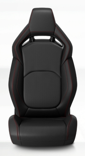
Capri Leatherette with Axis II perforated inserts and Red accent stitching. Available in Black or Demonic Red/Header Red. Available with Plus Group