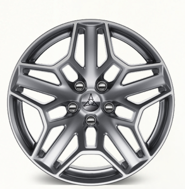
20 by 11-inch Satin Carbon // (WS5) Standard