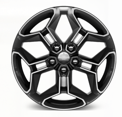
20 by 9-inch Diamond-Cut Baltic // (WRT) Available with Plus Group