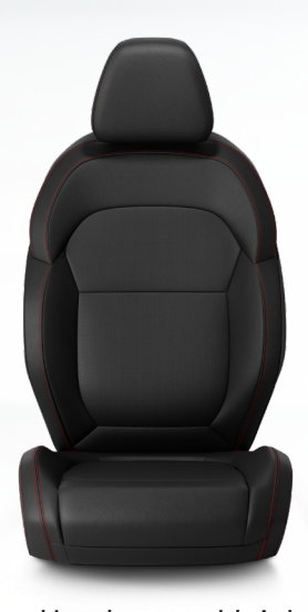
Capri Leatherette with Axis II perforated inserts and Red accent stitching. Black. Available with Plus Group