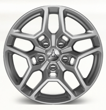
18 by 18-inch Tech Silver // [WBD] Standard