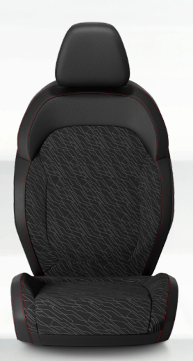
Capri Leatherette bolsters with Rift Fabric inserts with Header Red and Red accent stitching. Black. Standard