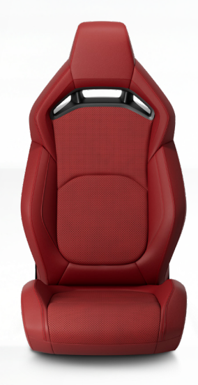
Capri Leatherette with Suede perforated inserts and Red accent stitching. Available in Black or Demonic Red/Header Red. Available with Track Pack