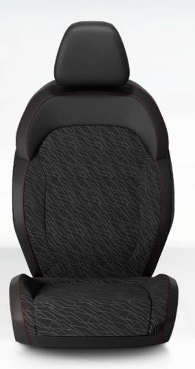
Leatherette bolsters with Rift Fabric inserts with Header Red and Red accent stitching. Black. Standard