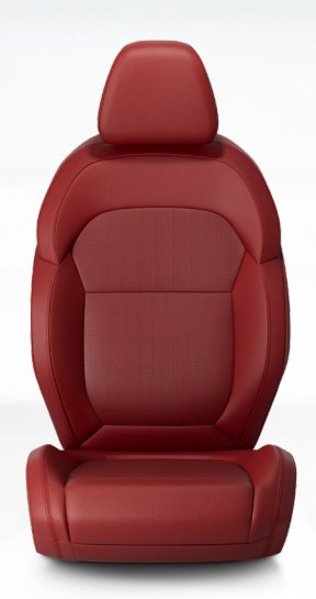
Capri Leatherette with Axis II perforated inserts and Red accent stitching. Demonic Red/Header Red. Available with Plus Group