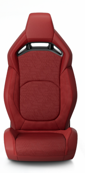
Nappa Leather outer bolsters and Suede inner bolsters and Live Wire Embossment with Axis II Suede inserts with Header Red and Red accent stitching. Available in Black or Demonic Red. Available with Carbon & Suede Package