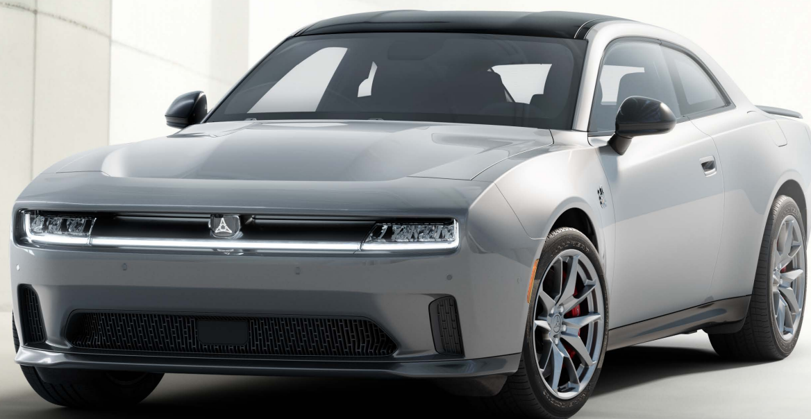
Dodge Charger Scat Pack shown with available Track Pack.

Nappa Leather outer bolsters and Suede inner bolsters and Live Wire Embossment with Axis II Suede inserts with Header Red and Red accent stitching. Available in Black or Demonic Red. Available with Carbon & Suede Package