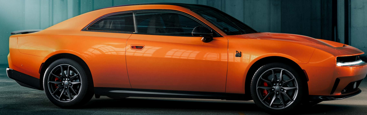
Dodge Charger Daytona Scat Pack shown in Peel Out with available Track Pack and Blacktop Package.

TRACK PACK (SCAT PACK) – Includes Red Brembo ® 6-piston fixed front calipers with 16-inch two-piece rotors and fixed rear calipers; 20 by 11-inch/11.5-inch wheels; 305/35R20 A/S BSW tires/325/35R20 A/S BSW tires; suede and leatherette high-back seats with power 12-way driver, power 12-way passenger, fixed head restraint 17 ; 4-way lumbar, heated, ventilated, driver memory; high-performance seat cushion; Gloss Black spoiler; dual-valve adaptive damping shocks and drive experience recorder with track mapping